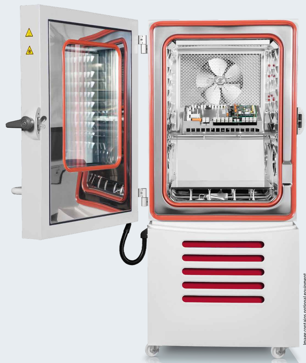
Image contains optional equipment

Optional equipment for individual solutions.